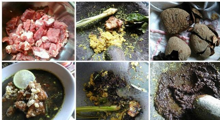
Figure 5.1. : making rawon in the traditional way

Geluran Kelurahan is a kelurahan in the Taman Subdistrict, Sidoarjo Regency, East Java Province. which borders Kalijaten in the north, kedung turi in the east, kletek in the west, and sukologok in the south. Various East Java typical food processing products such as rawon, soto, pecel, intercropping etc. in the Geluran Kelurahan environment are managed by local residents, many are still trapped in traditional production systems and business management based on home industries. The production process of food processing products which is supposed to be standardized and able to penetrate the wider modern market, and even to be able to penetrate the export market in the midst of the competition of the ASEAN Economic Community is still far from expectations. This is because there are still many productive local food processing business institutions that are still developing at home industry scale and do not have sufficient knowledge of standardized production processes, certified with registered trademarks and packaged in certain production qualities that can reach a wide market.