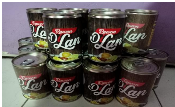
Figure 5.2 .: making rawon with hermetic technology applications

The implementation of the dissemination program consists of 3 main activities, namely: